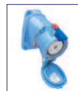
Female Receptacle with Angle Adapter 33-64243-C-K04 + MP6